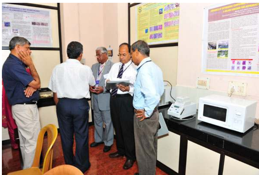
NAAC Peer Team in Research Lab